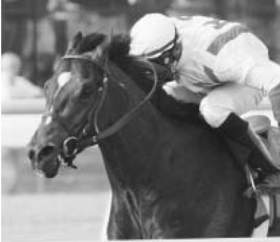
left: Summer Doldrums