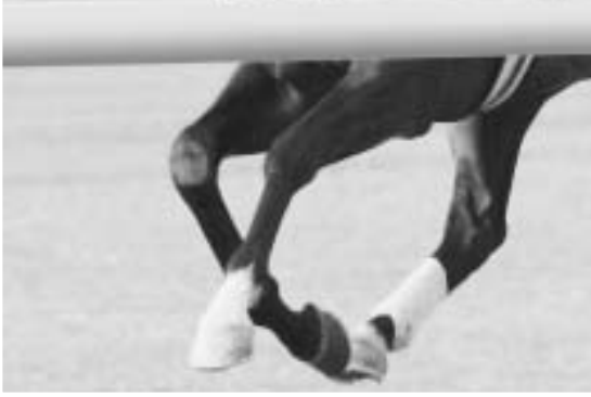
below: The VA Derby